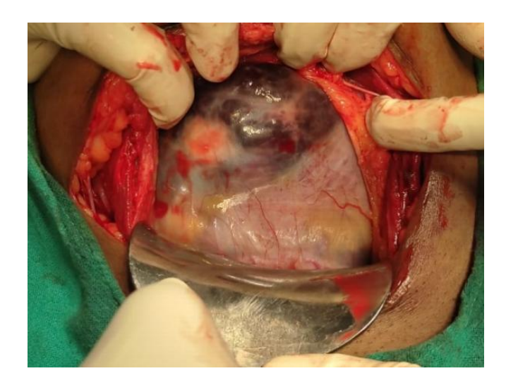
Figure 1. Lobes of placenta visible through the uterine window covered by serosa.

The myometrial layer's thickness in a previous caesarean section scar undergoes changes during pregnancy, with a more significant decline occurring between the second