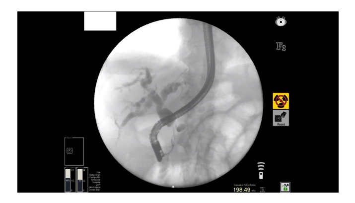
Figure 2. Distal biliary malignant stenosis in a patient affected by pancreatic carcinoma.

All patients underwent ERCP in the supine or lateral position using a standard duodenoscope. After successful biliary access, minimal biliary sphincterotomy was performed in all patients prior to metal stent insertion. The length of the stent was chosen according to the extension of the stricture in order to release the proximal end 1–2 cm beyond the stricture, and always below the hilum, with the distal uncovered portion outside the papilla. After estimating the length of the stricture during cholangiography (Figure 2), the endoscopist chose between the available types of Niti-S Biliary Covered stent (Both Bare Type) (Taewoong Medical Co. Ltd., Korea) (diameter of 10 mm and length from 4 to 8 cm) (Figure 3A and 3B).