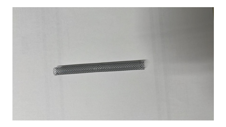
Figure 1. Image of Niti-S partially covered self-expandable metal stent (Taewoong Medical Co. Ltd., Korea).

maintaining biliary luminal patency in malignant strictures—minimum 18 years of age. Exclusion criteria: Patients with hepatic hilar obstruction patients with duodenal obstruction.