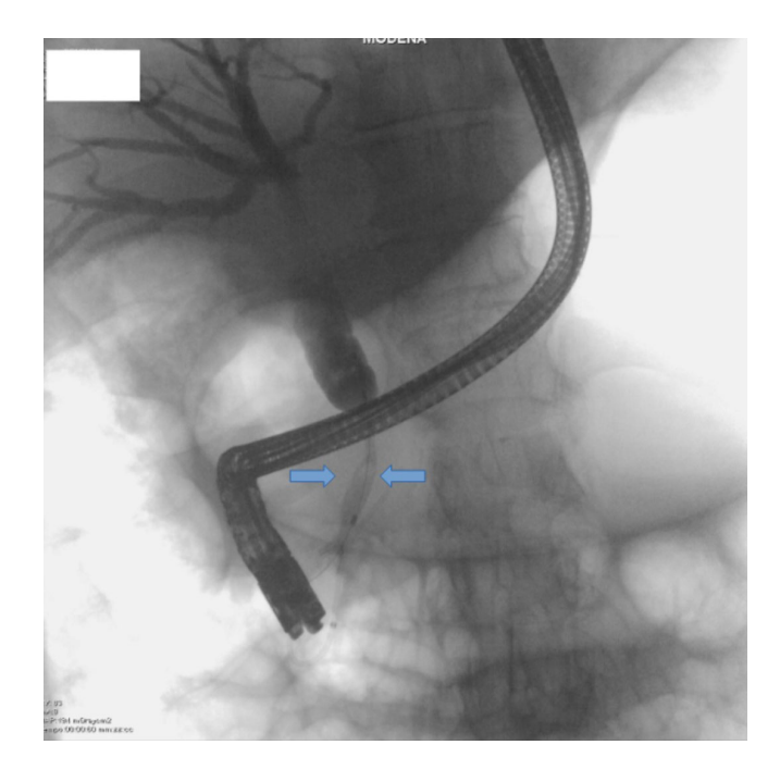
Figure 4. Niti-S Biliary partially covered self-expandable metal stent malfunction (inadequate expansion).

No serious stent-related adverse events were recorded in our study population. During a 6-month follow-up, no cases of stent migration were reported in all surviving