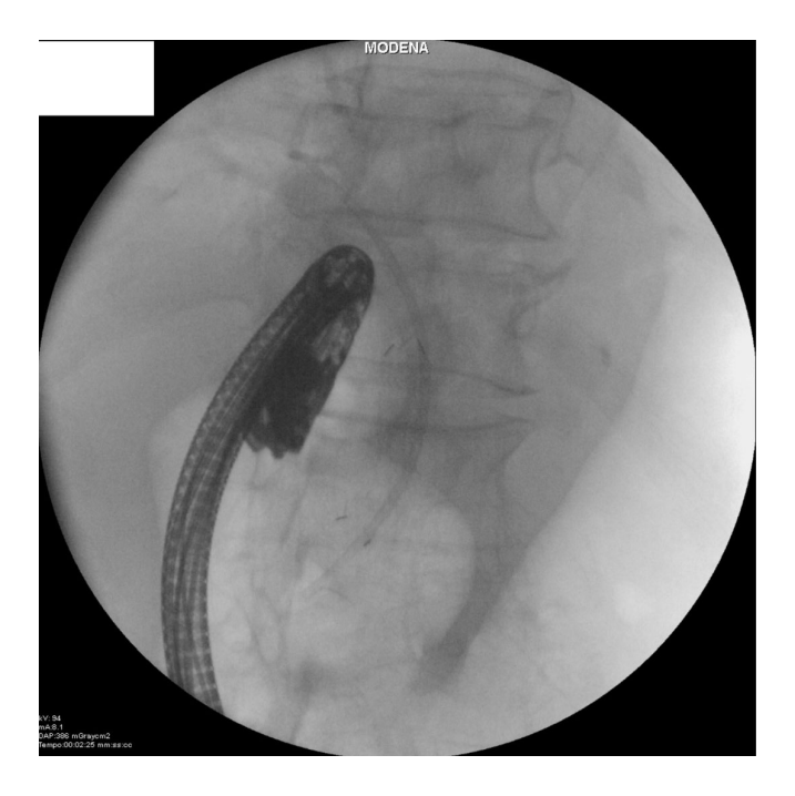
Figure 5. Recurrent biliary obstruction treated with placement of a co-axial plastic stent.